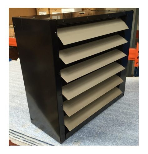
Adjustable front louvre blades at front