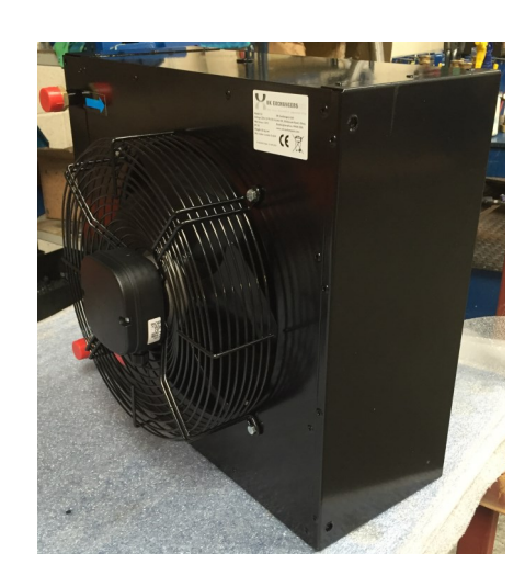
Compact design & fully enclosed casing