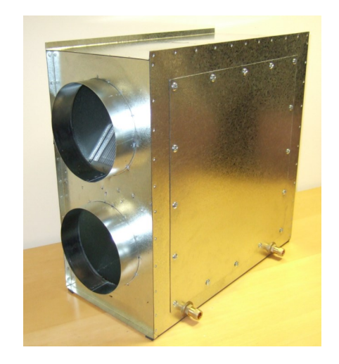
Galvanised steel plenum box