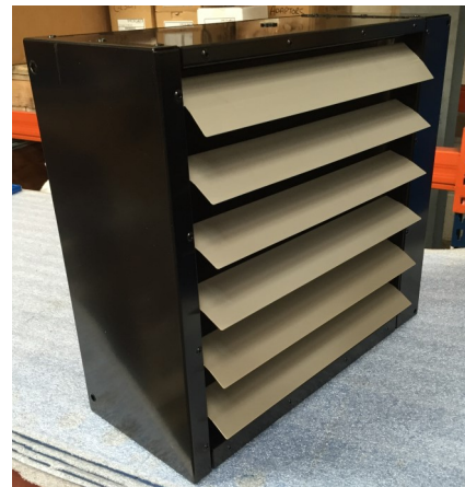
Adjustable front louvre blades at front