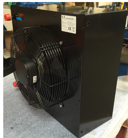
Compact design & fully enclosed casing